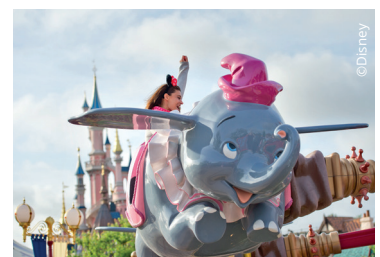
Dumbo the Flying Elephant