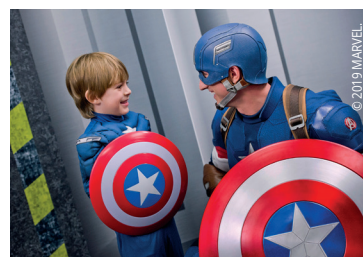
Heroic Encounter with Captain America