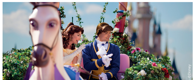
Disney Stars on Parade